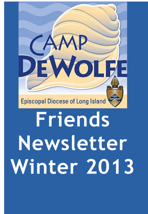
CAMP DEWOLFE GREET'S WINTER 2013