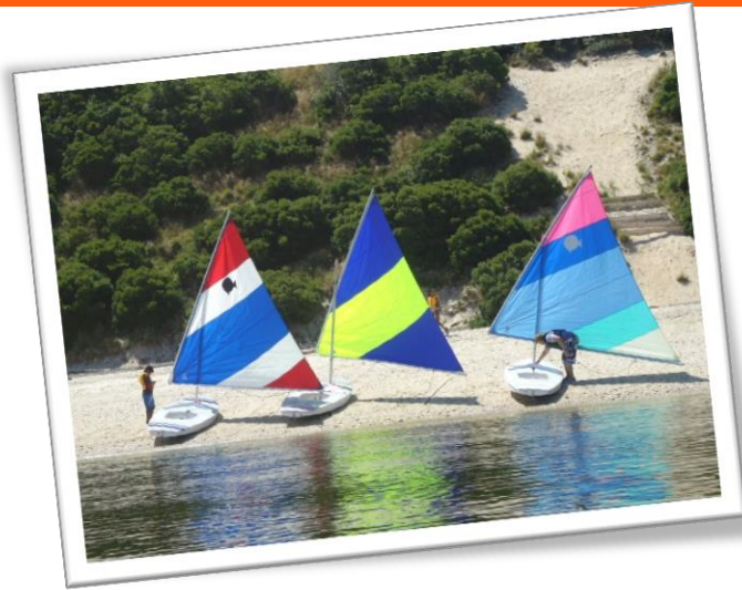
Don't miss out on all the fun!

Contact the Camp Office at (631) 929-4325 or email us at office@campdewolfe.org