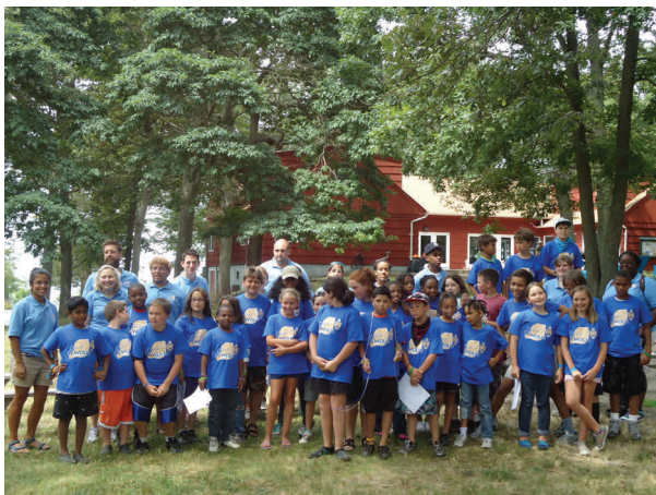
408 North Side Road, P.O. Box 487, Wading River, NY 11792 office@campdewolfe.org www.campdewolfe.org T: 631 929-4325 F: 631 929-6553

Ticks and Poison Ivy: As with many camps, the physical setting and activities involve campers spending time in nature. It is important to know your camper may come in contact with poison ivy, deer ticks and mosquitoes. In addition to your education prior to your child's arrival at camp, Campers are encouraged to do tick checks each evening themselves. Staff will not help campers check for ticks in abdomen and pelvic areas.